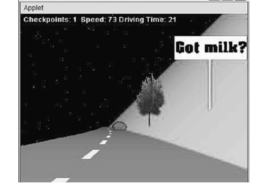
Fig. 1 The screen displayed during the driving task

dTank is a tank game simulator for agents in a distributed environment. dTank provides an architecture and platform neutral test-bed for adversarial real-time cognitive models, and a tool for teaching cognitive modeling, and agent creation. It was inspired by the Tank-Soar, and ModSAF systems.