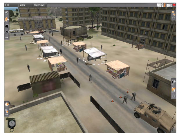
Figure 2. Layout of the example's market area.

In the SB scenario, the SB walks into a crowded market area; a BLUFOR patrol is observing the scene. The SB's goal is to destroy the BLUFOR unit by detonating the bomb he is carrying. In a variant of this scenario, the SB's goal is to maximise the civilian casualties. A diagram of the layout is shown in Figure 2.